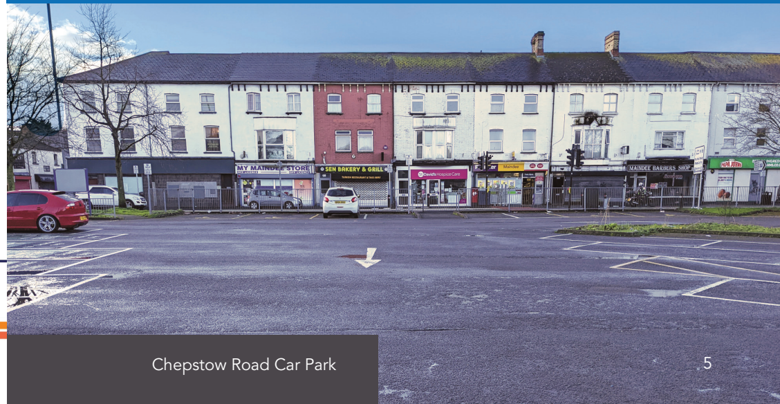
Chepstow Road Car Park

If the Renewal Project can start to effectively tackle these problems it could be a real help to current and future businesses – and their customers too.