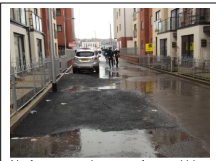
No footway and poor surfaces within the housing development

At the time of the Street Audit, a Housing Development was being completed on Millennium Walk. Due to the heavy rain that fell on the day, it was apparent that the road surfaces were of poor quality, causing the pooling of water. In addition, it seemed that there was no designated footway for people to walk through. Millennium Walk provides a key walking route between Maindee and the city centre and so, as such, this section is critically important. The problems identified may have been caused as the development had not been finished at the time. It will be necessary to consult with the