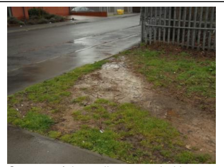
Corners of the walkway eroded by desire lines

The Walkway between Corporation Road and the River Usk is a key access point to the local area. It enables Maindee residents to walk or cycle to the Riverside as an ideal route into the city centre. Street audit participants explained that wild flower seeds were planted last year in the verges to improve the appearance of the walkway. It would also be prudent to introduce curves in design at the beginning and end of the walkway to avoid desire lines eroding the grass verges. Curved lines would also improve the appearance of the walkway for pedestrians.