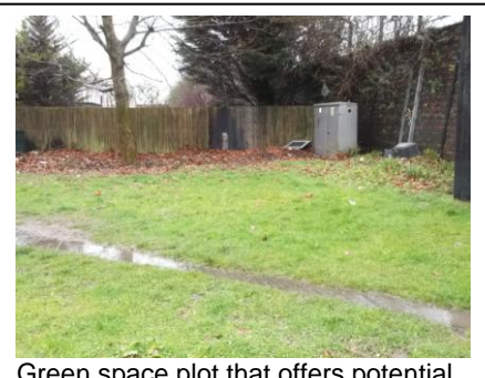
Green space plot that offers potential for renovation

The green space plot on the corner of Wharf Road and Jeffrey Street is currently regularly littered with fly tipping. As previously stated, Maindee as a neighbourhood has a low amount of green spaces for residents. As a result, this green space offers real potential to be redeveloped into an additional space where people are happy to spend their time. Clarification with Newport City Council needs to initially take place on the ownership of the land and there are a number of electricity boxes on the plot which will restrict the use of the land.