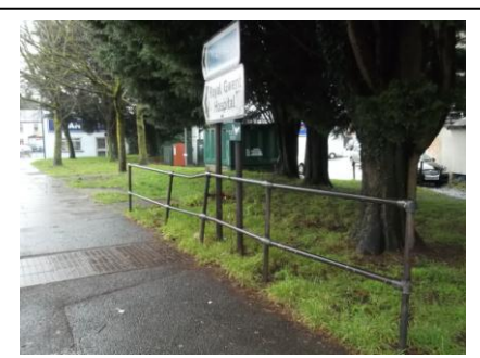
Poorly utilised green space plot on corner of Wharf Road

Turning from Chepstow Road onto Wharf Road, the Street Audit encountered a strip of green space that is poorly utilised. There is a short length of guard railing that serves no purpose and a series of trees with low hanging branches that significantly reduce the natural light for the space. Maindee has a limited amount of green space to offer to its residents and so it is important that each potential green space plot is maximised. If this strip of green space is re-designed, it would be more attractive for people to travel through and spend time in.