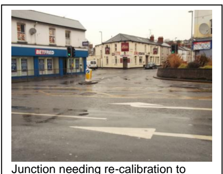
enable residents to move safely

The current design of the Chepstow Road / Albert Avenue junction favours motor vehicles, with wide exit and entry carriage ways. It is also a reasonably complicated junction with a number of roads meeting at one point. For people walking around or through Maindee's retail centre, the junction provides a significant obstacle to overcome. There is a lack of designated crossing points and the wide carriageways mean that it feels precarious for local residents to cross where they need to There is also a reasonably large poorly maintained flower bed on the corner of the junction.