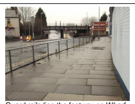
Guard rails line the footway on Wharf Road

The Street Audit identified numerous locations in the Maindee neighbourhood where guardrails are in place. There is a significant length of guard rails on Wharf Road. Elsewhere, there is some guard rails in front of the Pay and Display car park set back from Chepstow road in Maindee's retail centre. This particular section of guard rails serves no purpose as it is located between the edge of the footway and the car park and so is currently serving as street clutter and should be removed.