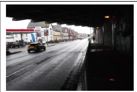
Poor lighting and noise are the key features walking under the train bridge

Specifically, walking under the bridge is a noisy experience. The lighting is poor. The