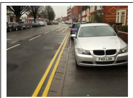
Pavement parking and double yellow lines

were not being enforced. As a result, it seems that there is a general culture for people to park on the double yellow lines knowing that they will not be penalised. On Corporation Road the Street Audit identified a large number of cars parked on double yellow lines, but also parked on pavements next to double yellow lines. This practise makes Maindee's local streets more unsafe for its residents. The parking on pavements provides significant obstruction for people with mobility issues, sight impairments or buggies with children.